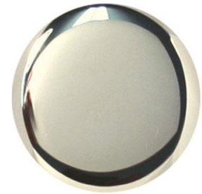
PVD Silver Bright