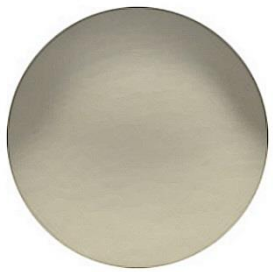
PVD Stainless Steel Pearl