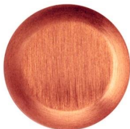
EP Nickel Bronzestone Brushed