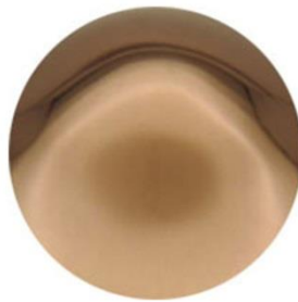
PVD Copper-Bronze Bright