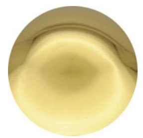
PVD Gold-Old Pearl