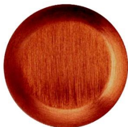
EP Nickel Cedar Brushed