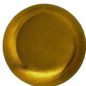
EP Gold Antique Brushed