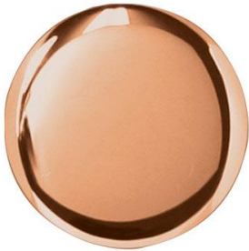
PVD Copper Bright