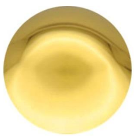
PVD Gold Pearl