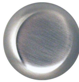
EP Silver Brushed