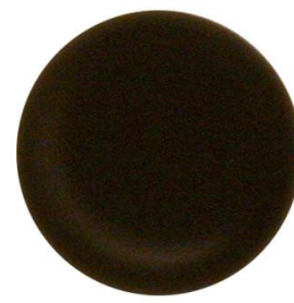
EP Bronze Oil Rubbed