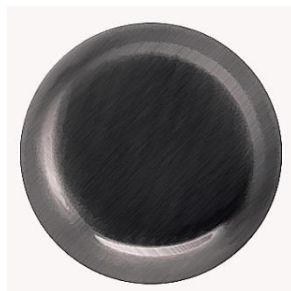
EP Nickel Antique