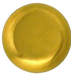
EP Gold Brushed