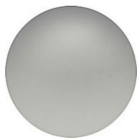
PVD Nickel Pearl