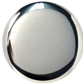
PVD Nickel Bright