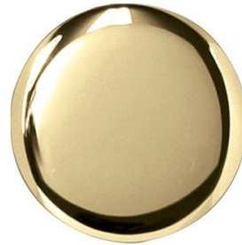
PVD Brass Bright