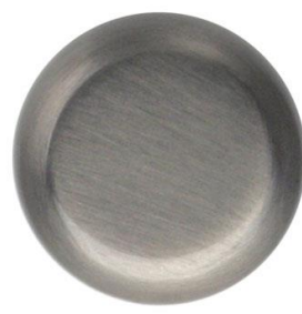
EP Nickel Brushed