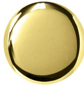
PVD Gold-Old Bright