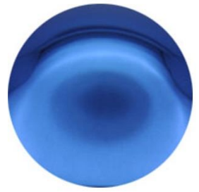
PVD Color Blue