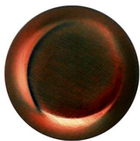
EP Bronze Scotia Brushed