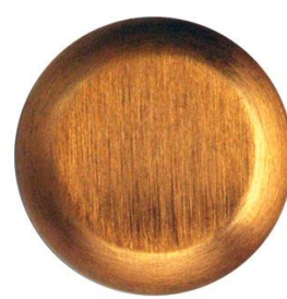
EP Bronze Antique Brushed