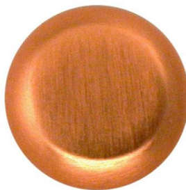
EP Copper Antique Brushed