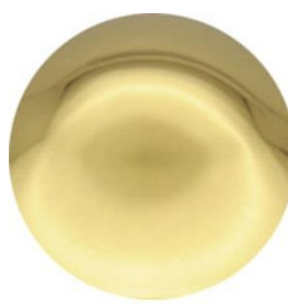
EP Gold Tiffany Brushed