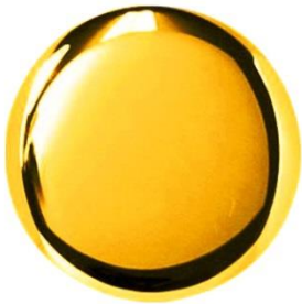
PVD Gold Bright