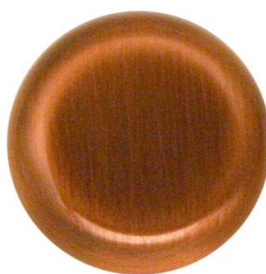
EP Bronze Brushed