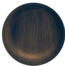
EP Bronze Venetian Brushed