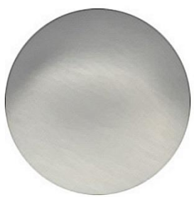
PVD Chrome Pearl