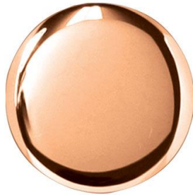
PVD Copper Star