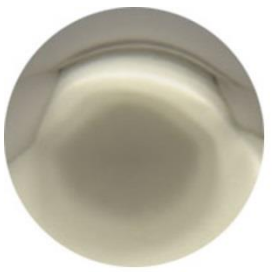
PVD Stainless Steel