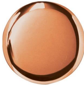
PVD Copper Antique