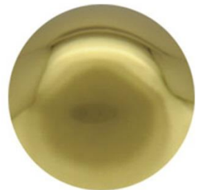
PVD Brass Pearl