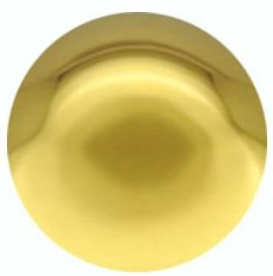
PVD Gold Antique